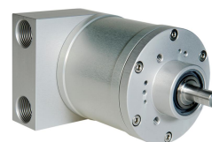
EXME – Shaft