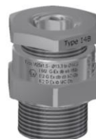
Cable Gland M25 x 1,5